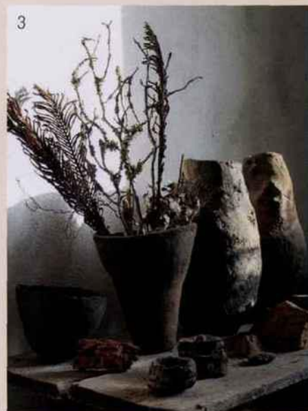
1/ Laurette Broll 2/ Les Guimards chez Empreintes Paris 3/ Sherna Ceramica